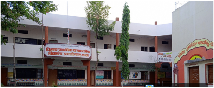
Vishal secondary school, Pragati nagar , Latur