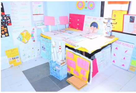
Art And Craft Room