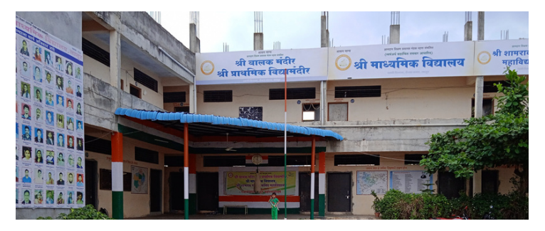
shree secondary school, Vaibhav nagar , Latur